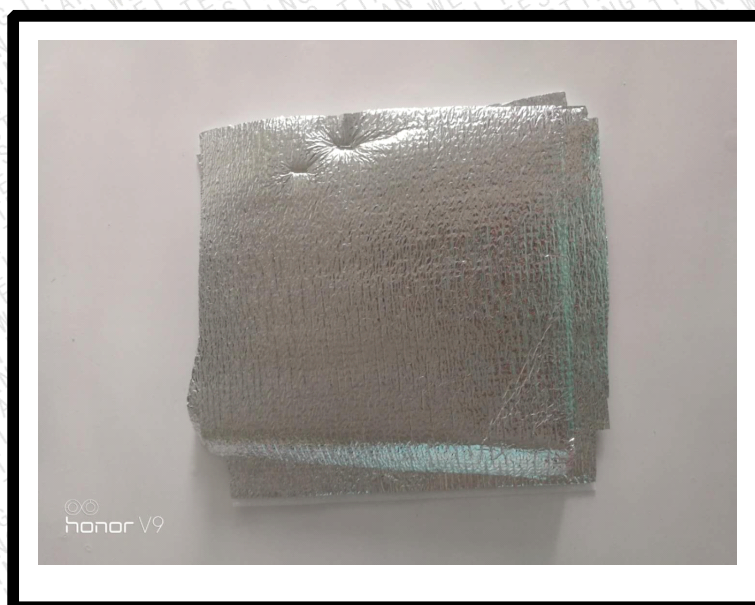
Sample product image